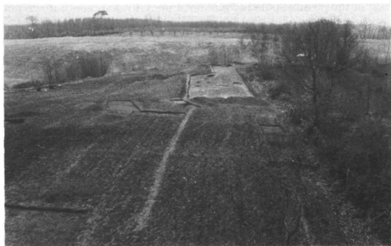
Trench I, looking south.