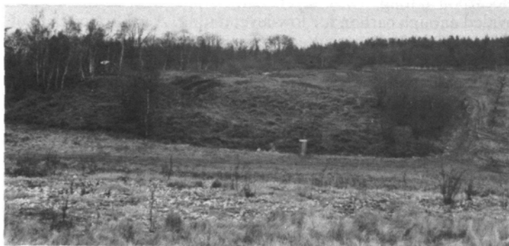
The slighted southern rampart, looking north, towards the excavation.