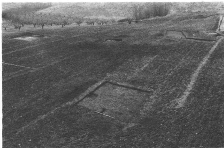
Trench II, looking south-east.